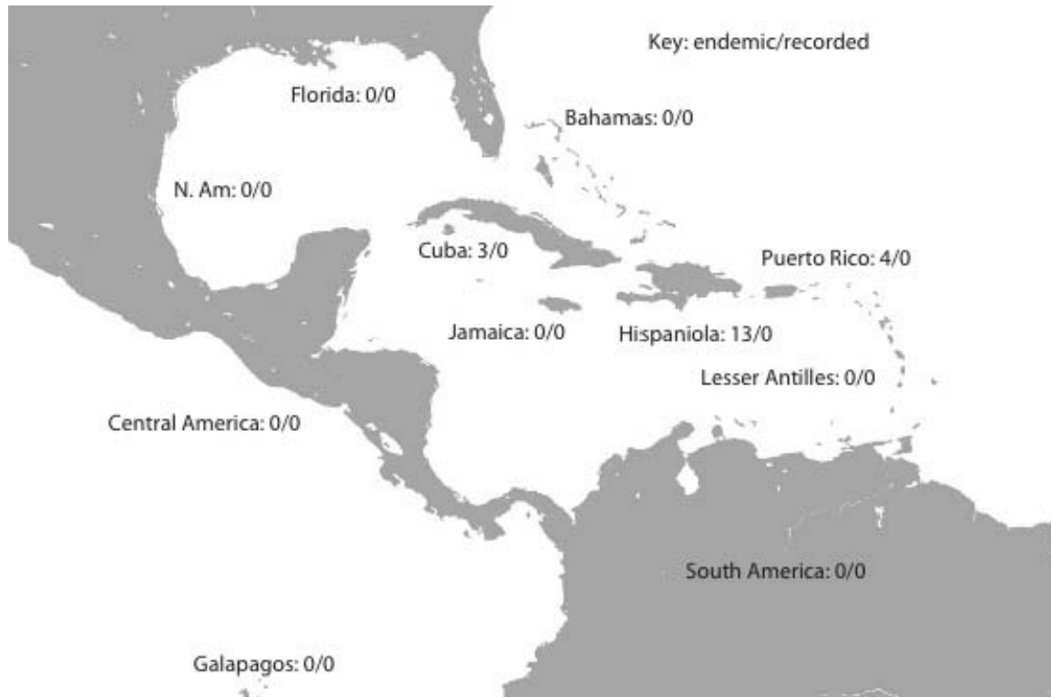
Fig. 1. Distribution of Antillattus and relatives, from Platnick (2011) and Zhang (PhD thesis, in prep.).

This represents a clade endemic to Caribbean within the subfamily Euophryinae. The current division of genera within this clade is based on the molecular phylogeny. They are small to medium-sized, with some ( Antillattus spp.) usually having elongate or modified chelicerae. So far, 20 extant species are known from Cuba, Hispaniola and Puerto Rico. But more species may be discovered, especially from other islands.