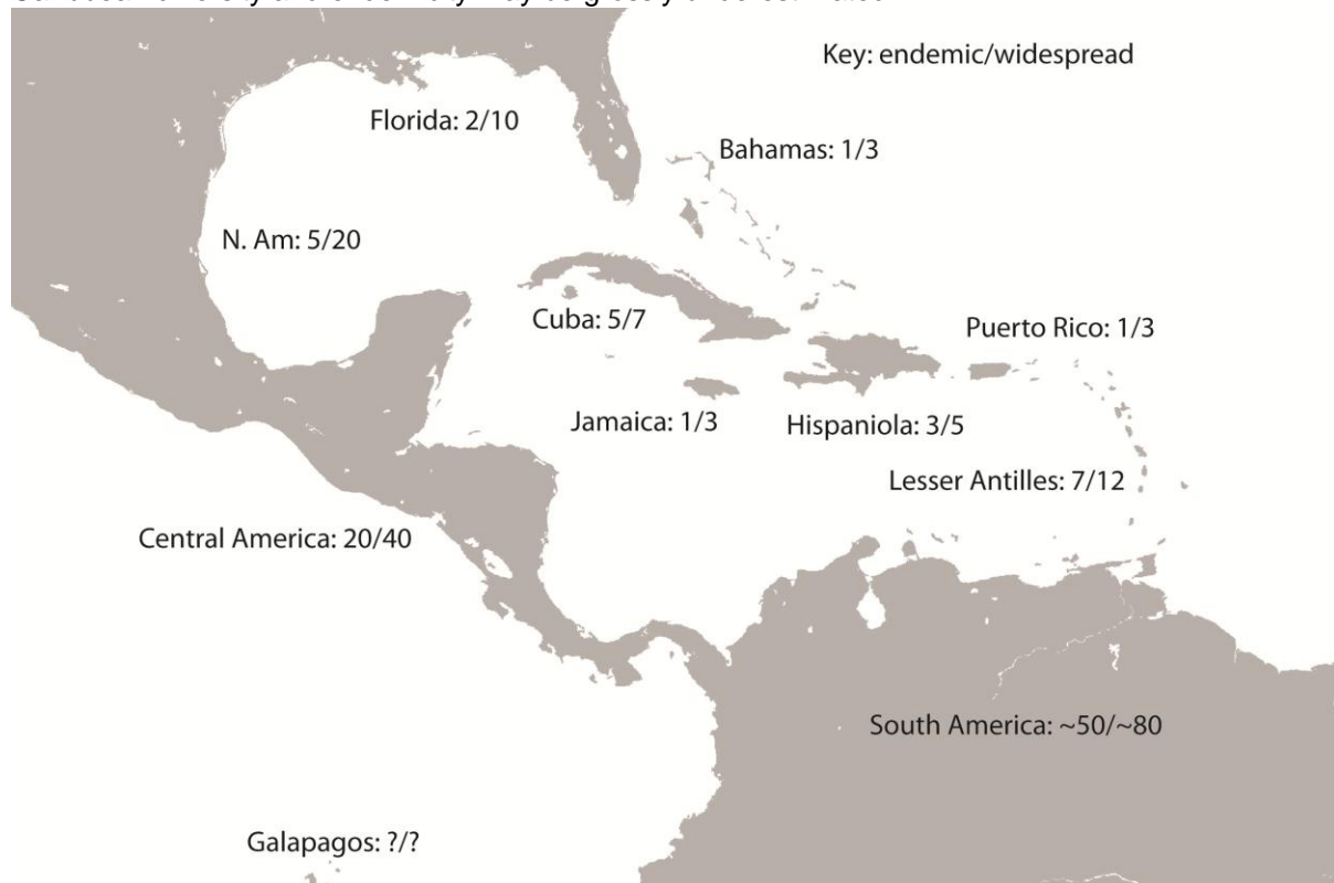
Fig. 1. Distribution of likely Eustala species, based on real diversity (90+) listed in Platnick (2011) and additional unknown diversity (estimation).

Eustala is a New World araneid genus, which seems to be extremely diverse on the mainland Americas, and poorly known from the Caribbean (Fig. 1). Its taxonomy is unresolved and its monophyly untested, but it can easily be diagnosed from other araneids, albeit only by genitalic characters (Fig. 2). Levi did not revise this genus, hence the diversity here is only estimated, but it is likely that Eustala may represent the species richest Neotropical araneid genus (see Kuntner and Levi, 2007). Hence, the Caribbean diversity and endemism may be grossly underestimated.