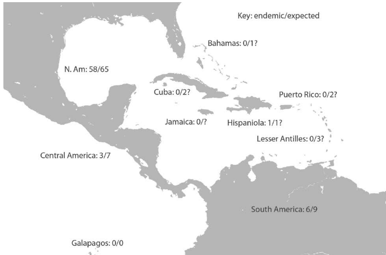
Fig 1. Distribution of Mermessus in the study region (based mostly on Platnick).

Mermessus is a common and diverse erigonine genus, especially in North America but also getting into other parts of the study area, where it has been less thoroughly documented. Mermessus typically build small sheet webs at ground level.